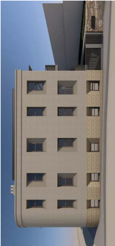
Rodens Lane View