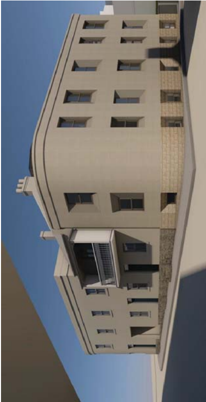
Bettington and Rodens Lane Corner