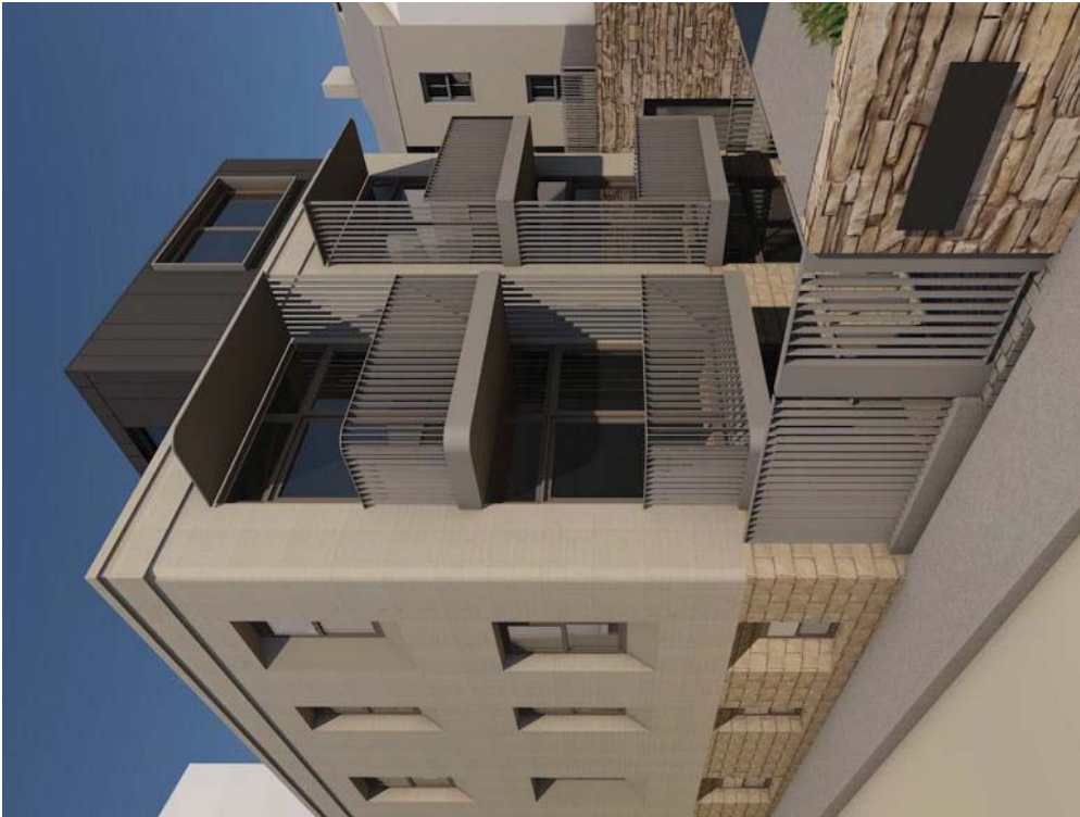
Rodens Lane Rear View

Notes The information contained in the document is copyright by Stuido Dot Pty Ltd and may not be used or reproduced for any other project or purpose without the express written consent of Stuido Dot Pty Ltd. The commencement of work, verify all dimensions and levels on site and report any discrepancies. Drawings are to be read in conjunction with all contract documents. Use figured dimensions only. Do not scale from drawings. There is no guarantee with the accuracy of content and format for copies of drawings issued electronically. The completion of the issue details checked and authorised section below a confirmation of the issue details checked and authorised for use used for construction unless endorsed For Construction" and authorised for issue.