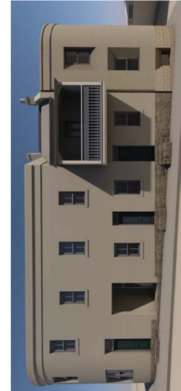
Bettington Street View