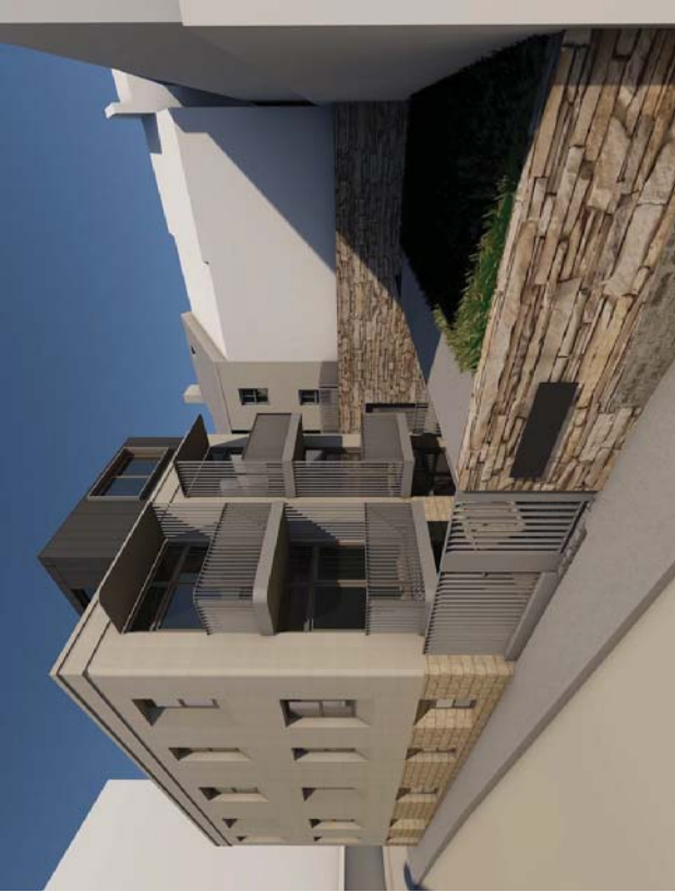
Rodens Lane Detail View